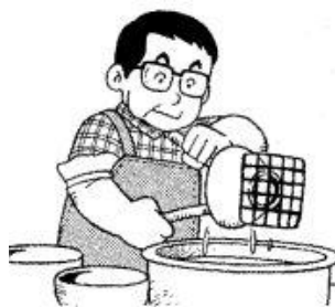
Painting and Glazing

Activity: Creating "Traditional Japanese" designed paper plate