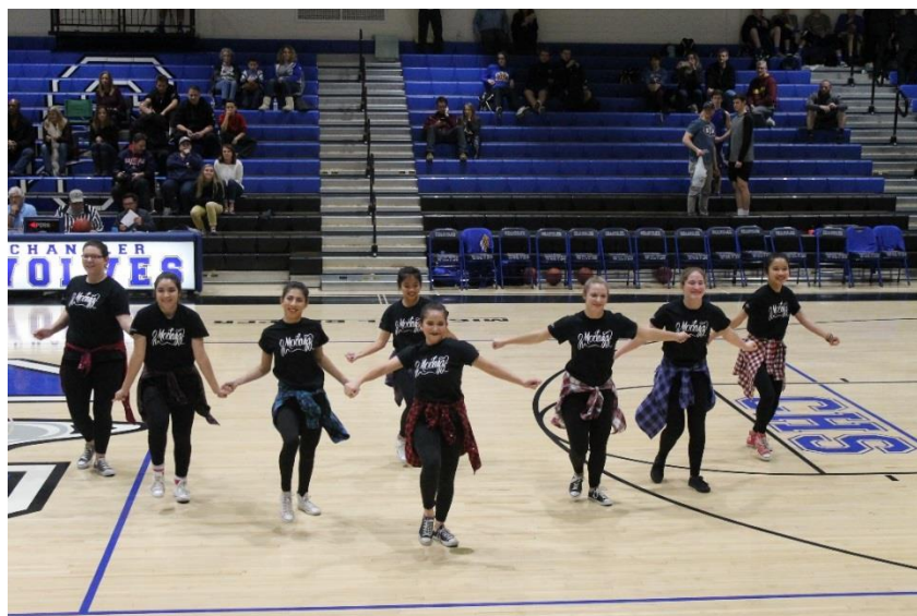
Modazz performing at basketball halftime