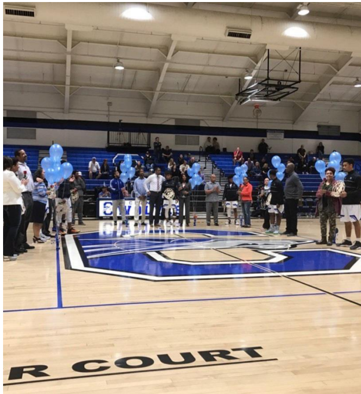
Varsity Boys Basketball Seniors being recognized at Senior Night