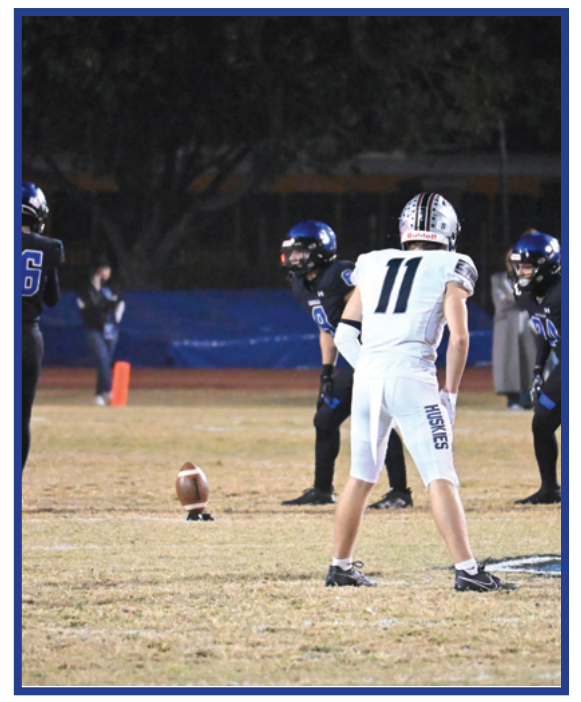
Varsity Football Battles for Arizona Avenue