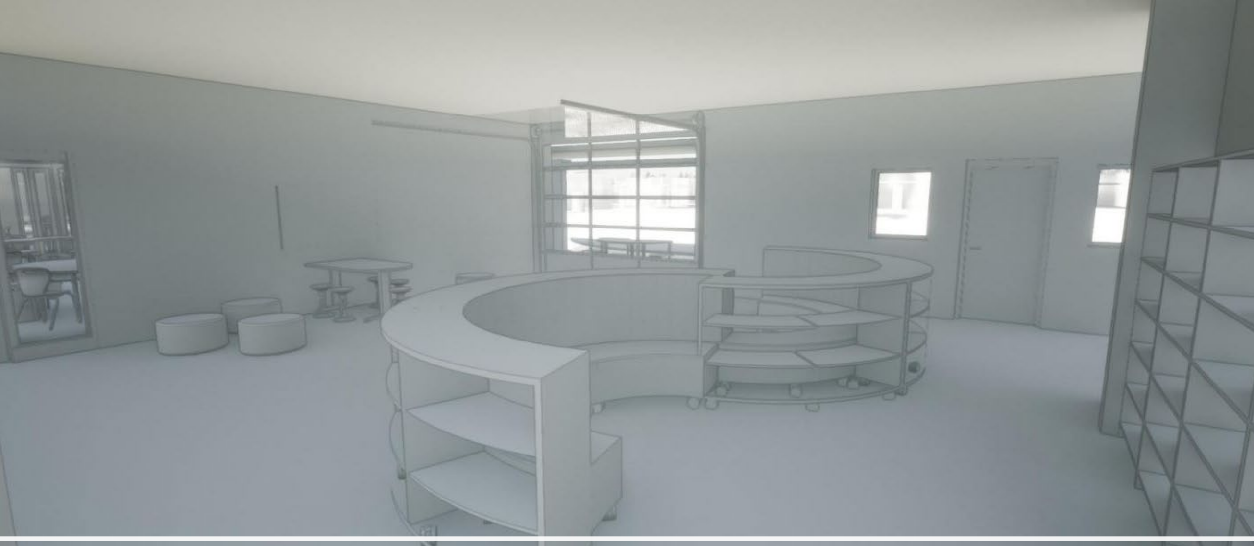
Break-Out Literacy Space