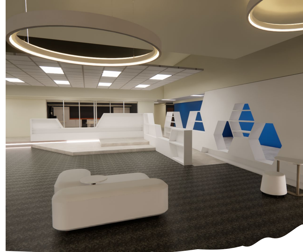
Frye – MakerSpace & Ramp