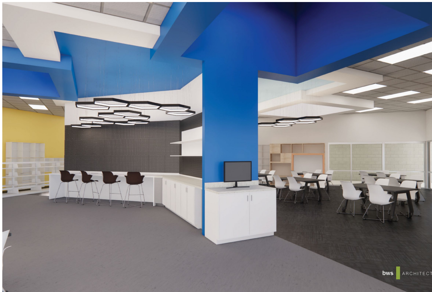
Hull – Tech Center View