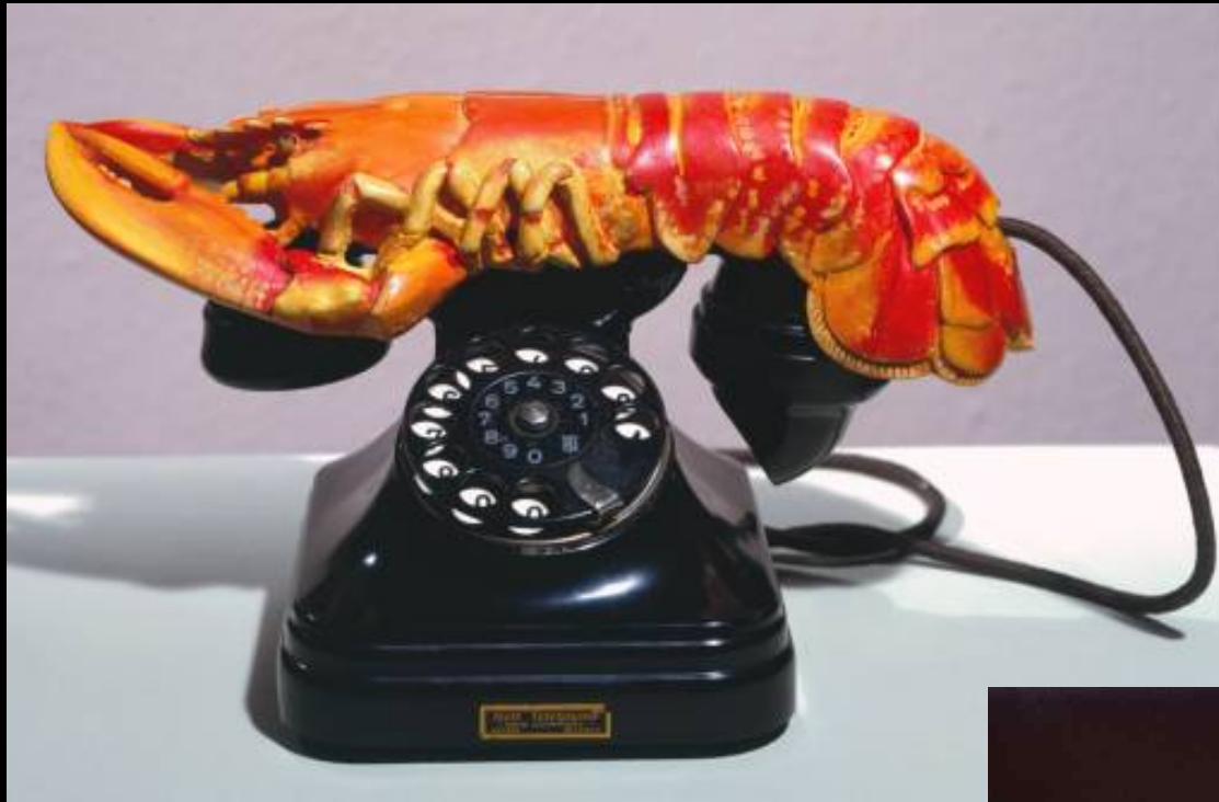
LOBSTER TELEPHONE (1936)