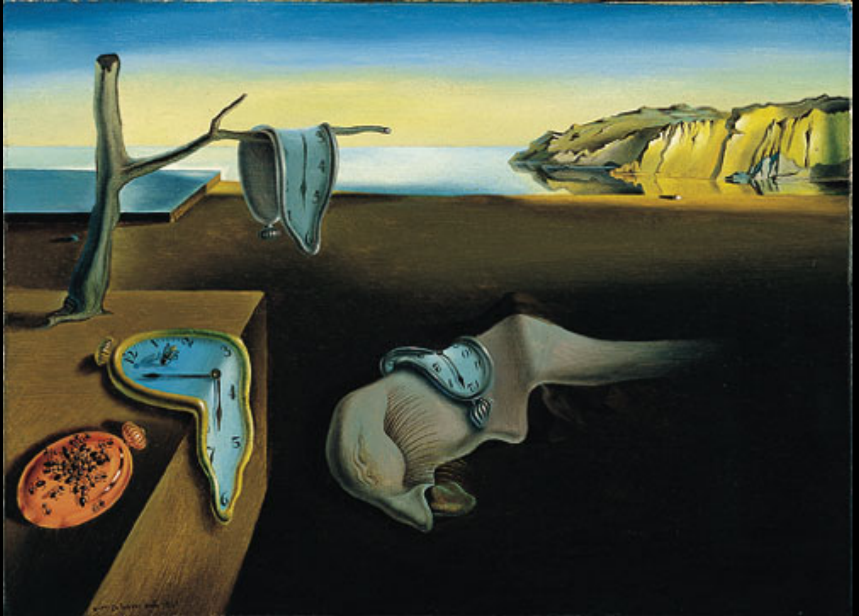
THE PERSISTENCE OF MEMORY (1931)