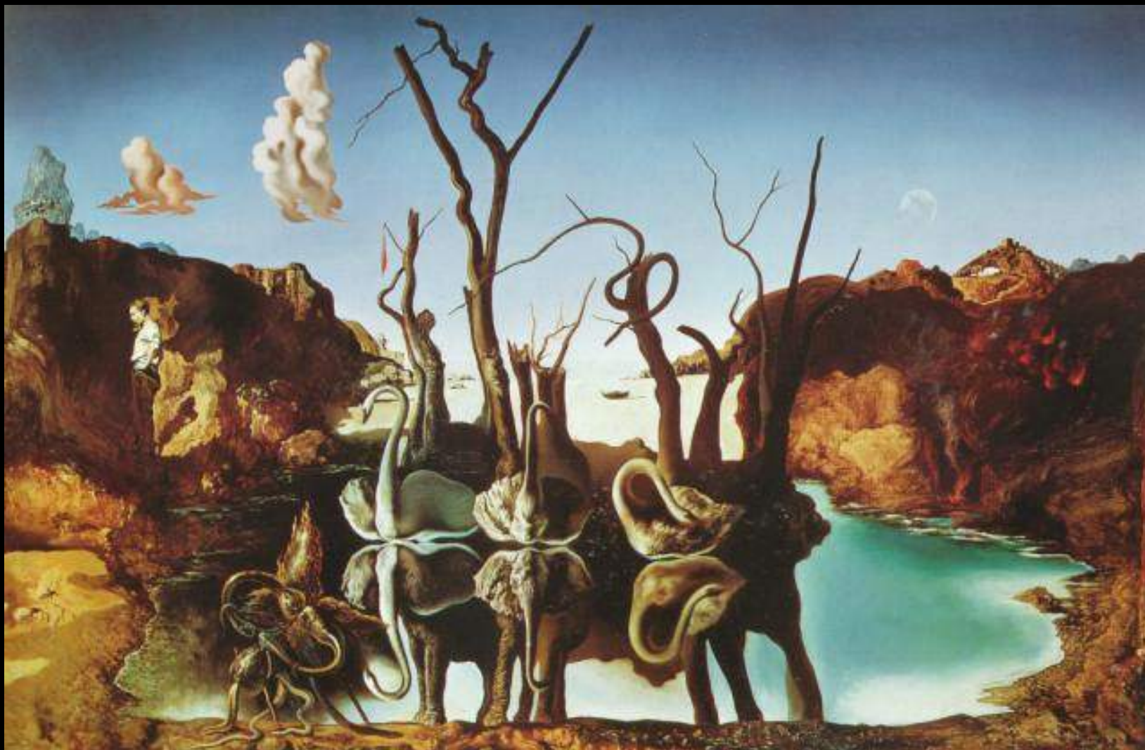
SWANS REFLECTING ELEPHANTS (1937)