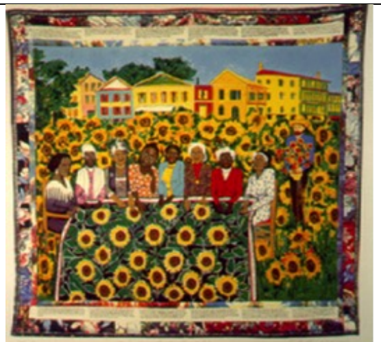
The Sunflower Quilting Bee

Brief info about the project: Students had their own quilting bee today each designing their own quilt block which was later assembled into a paper quilt.