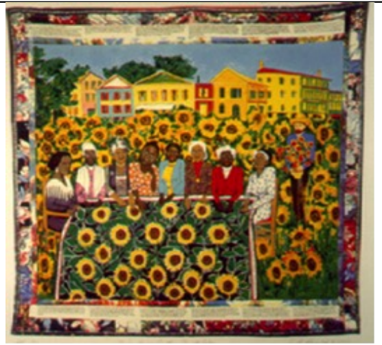
The Sunflower Quilting Bee

Brief info about the project: Students had their own quilting bee today each designing their own quilt block which was later assembled into a paper quilt.