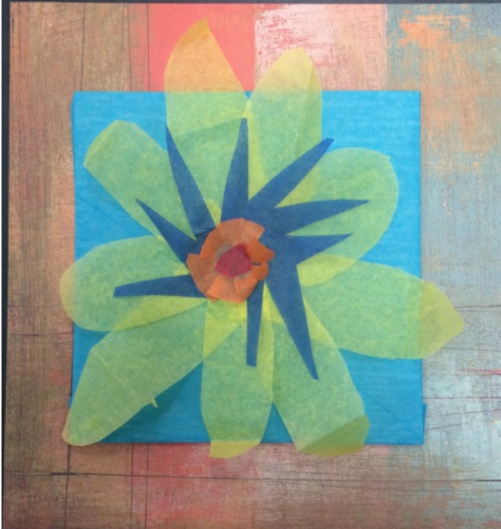
Chandler Unified School District Art Masterpiece