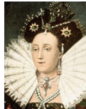
Queen Elizabeth I 1533–1603

During Elizabeth's reign, London, the capital of the nation, flourished as a great commercial center, the hub of England's growing overseas empire. London was also the hub of the artistic efforts that Elizabeth championed, and it attracted talented and ambitious individuals from all over the land.