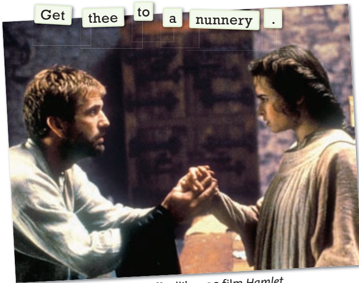
A scene from Franco Zeffirelli's 1990 film Hamlet