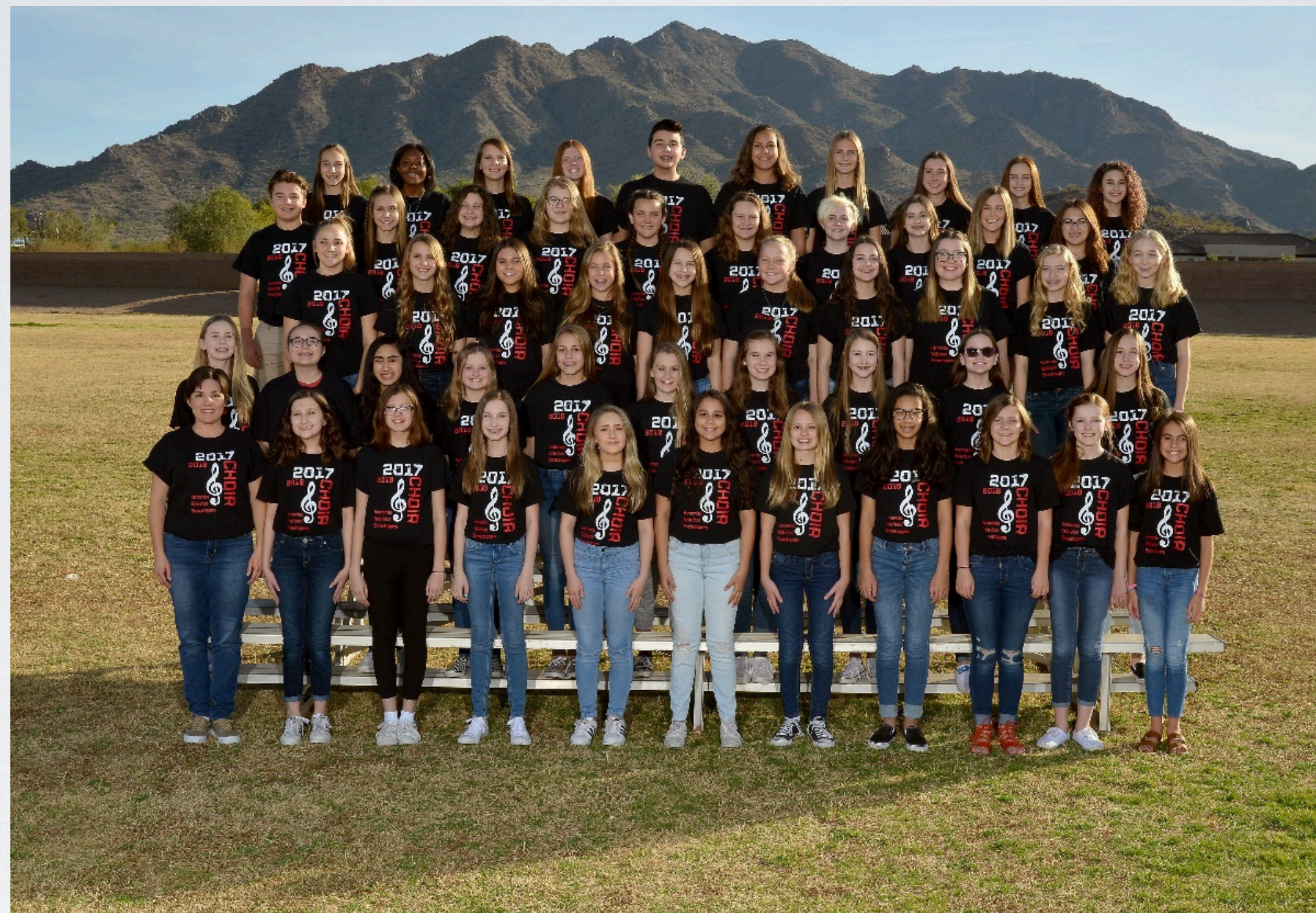
National Anthem performed by: PJHS Advanced Choir