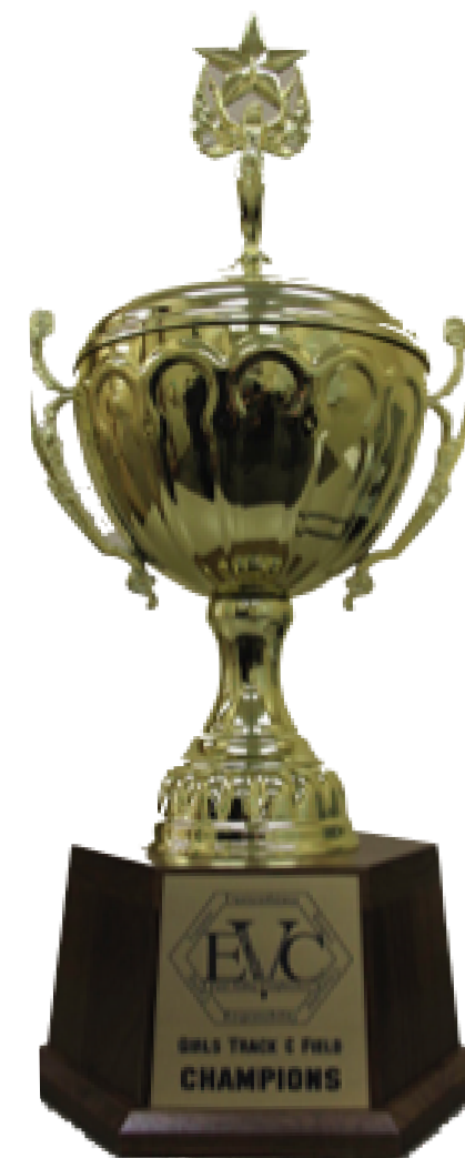
7 th Flag Football