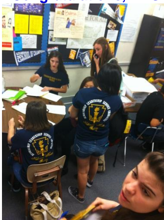
Members of the NHS Induction committee prepare to “tap” new members.

The National Honor Society inducted 235 new students into their program. These students have shown excellence in scholarship, character, leadership and community service. New inductees were “tapped in” by current NHS members last Thursday and read a letter of congratulations and given a carnation. Congratulations, NHS members!